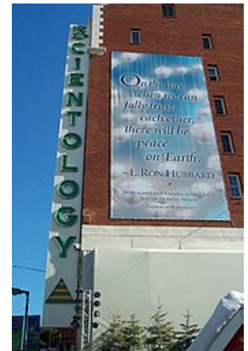
A Scientology Center on Hollywood Boulevard in Hollywood, Los Angeles, California

In 1957, the Church of Scientology of California was granted tax-exempt status by the United States Internal Revenue Service (IRS), and so, for a time, were other local branches of the organization. [89][48] In 1958 however, the IRS started a review of the appropriateness of this status. [89] In 1959, Hubbard moved to England,