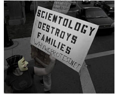
A protester criticizes Scientology

The Arbitration Committee of the Wikipedia internet encyclopedia decided in May 2009 to restrict access to its site from Church of Scientology IP addresses, to prevent self-serving edits by Scientologists. [352][353] A "host of anti-Scientologist editors" were topic-banned as well. [352][353] The committee concluded that both sides had "gamed policy" and resorted to "battlefield tactics", with articles on living persons being the "worst casualties". [352]