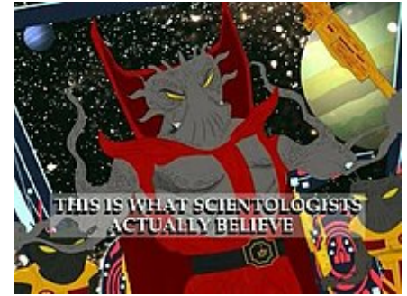
Xenu as depicted in South Park

In November 2016, cable network A&E began airing Leah Remini: Scientology and the Aftermath , a documentary series. Remini, a TV actress and star, was a member of the Church of Scientology for over 30 years and a public proponent of Scientology for years before a public falling out in 2013. She is an executive producer of the series. The series follows Remini and former Scientology executive Mike Rinder as they explore the history and workings of the Church, discuss their experiences and interview ex-members willing to speak out about alleged abuses of the Church. The initial episode drew 2.1 million viewers. [486]