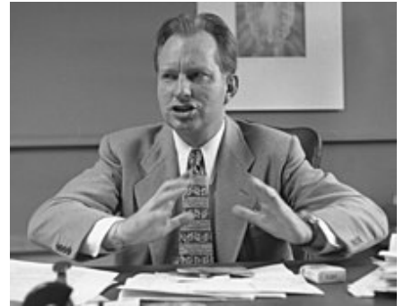
L. Ron Hubbard in 1950