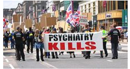
Scientologists on an anti-psychiatry demonstration

From 1969, CCHR has campaigned in opposition to psychiatric treatments, electroconvulsive shock therapy , lobotomy , and drugs such as Ritalin and Prozac . [183] According to the official Church of Scientology website, "the effects of medical and psychiatric drugs, whether painkillers, tranquilizers or 'antidepressants', are as disastrous" as illegal drugs. [146]