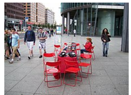
Scientology desk near the Potsdamer Platz in Berlin

In conjunction with the Church of Scientology's request to be officially recognized as a religion in Germany, around 1996 the German state Baden-Württemberg conducted a thorough investigation of the group's activities within Germany. [390] The results of this investigation indicated that at the time of publication, Scientology's main sources of revenue ("Haupteinnahmequellen der SO") were from course offerings and sales of their various publications. Course offerings ranged from (German Marks) DM 182.50 to about DM 30,000 – the equivalent today of approximately $119 to US$19,560. Revenue from monthly, bi-monthly, and other membership offerings could not be estimated in the report, but was nevertheless placed in the millions. Defending its practices against accusations of profiteering , the organization has countered critics by drawing analogies to other religious groups who have established practices such as tithing , or require members to make donations for specific religious services. [391]