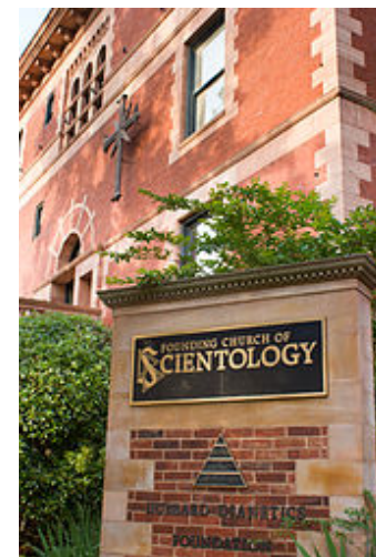
Founding Church of Scientology in Washington, D.C.

In December 1953, Hubbard incorporated three Church of Scientology organizations – a "Church of American Science", a "Church of Scientology" and a "Church of Spiritual Engineering" – in Camden, New Jersey . [109] On February 18, 1954, with Hubbard's blessing, some of his followers set up the first local Church of Scientology, the Church of Scientology of California, adopting the "aims, purposes, principles and creed of the Church of American Science, as founded by L. Ron Hubbard". [109][110] The movement spread quickly through the United States and to other English-speaking countries such as Britain, Ireland, South Africa and Australia. [111] The second local Church of Scientology to be set up, after the one in California, was in Auckland, New Zealand . [111] In 1955, Hubbard established the Founding