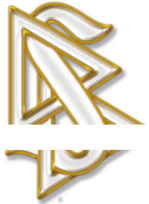
The Scientology symbol is composed of the letter S, which stands for Scientology, and the ARC and KRC triangles, two important concepts in Scientology.

Paul Thomas Anderson's 2012 film The Master features a religious organization called "The Cause" that has many similarities to Scientology. [480][481][482] Also, the character of Lancaster Dodd, played by Philip Seymour Hoffman , shares a physical resemblance to Scientology founder L. Ron Hubbard . [483]