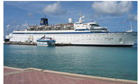
Scientology cruise ship Freewinds

A Scientologist who communicates with a suppressive person risks being declared a Potential Trouble Source . [199][200] Defectors who turn into critics of the movement are declared suppressive persons, [201][202][203][204] and the Church of Scientology has a reputation for moving aggressively against such detractors. [205]