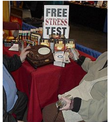
A Scientologist introduces the E-meter to a potential student