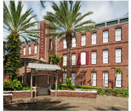
Church of Scientology of Tampa, Florida