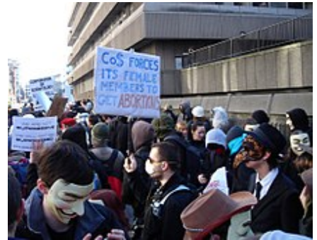
A protester holds a sign which reads: "C[hurch] o[f] S[cientology] forces its female members to get abortions" (February 10, 2008)