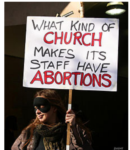
Protester against Scientology, holding a sign which reads: "What kind of church makes its staff have abortions"