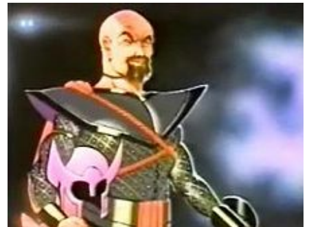
Xenu as depicted by Panorama

These are the OT levels, the levels above Clear , whose contents are guarded within Scientology. The OT level teachings include accounts of various cosmic catastrophes that befell the Thetans. [185] Hubbard described these early events collectively as " space opera ".