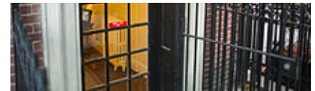
Scientology center in New York City