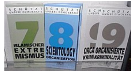
Official German information leaflets from the Bavarian Office for the Protection of the Constitution on (from left to right) Islamic extremism, Scientology, and organized crime. [250][251] "Several states published